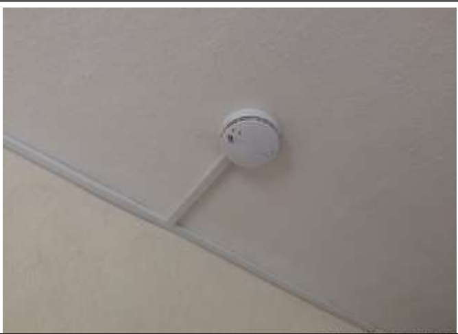
Location – Lounge