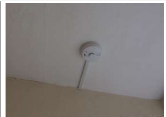
Location – Kitchen