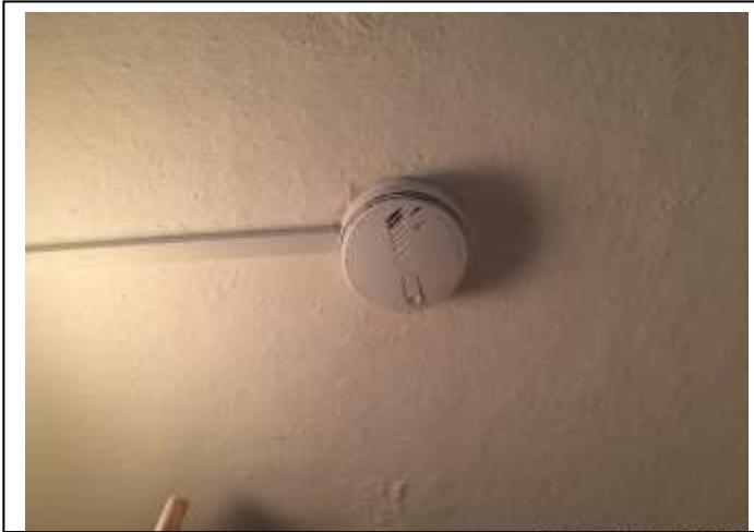
Location – Hall