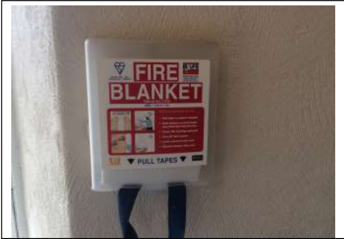
Location – Kitchen